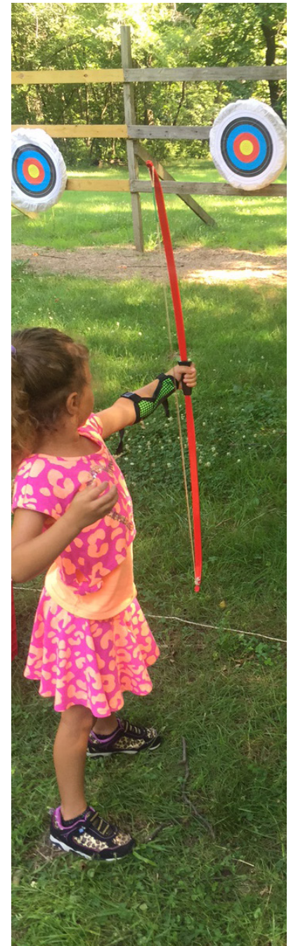
Program Year 2015 Statistics Shown

Youth surveys show statistically significant increases from pre- to post-evaluation on all indicators of thriving.